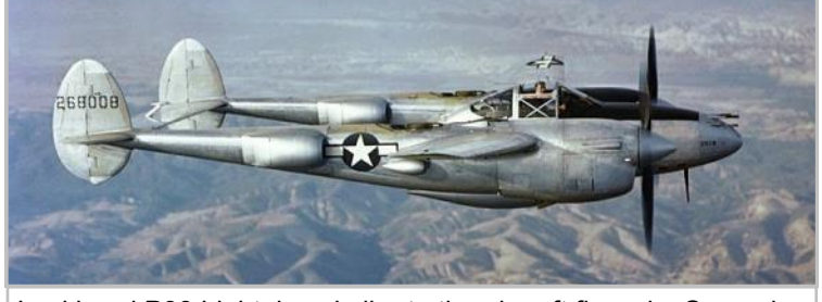
Lockheed P38 Lightning similar to the aircraft flown by Second Lieutenant Burnett

The cost of this has been paid for by a Croston resident who was 7 years old when the accident occurred.