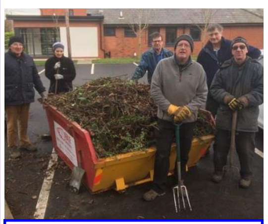
A job well done - the garden waste we collected was taken for re-cycling