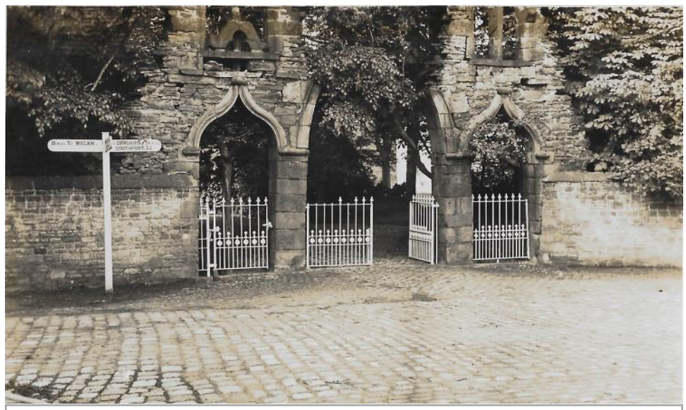
The 'Rectory Ruins' in better days