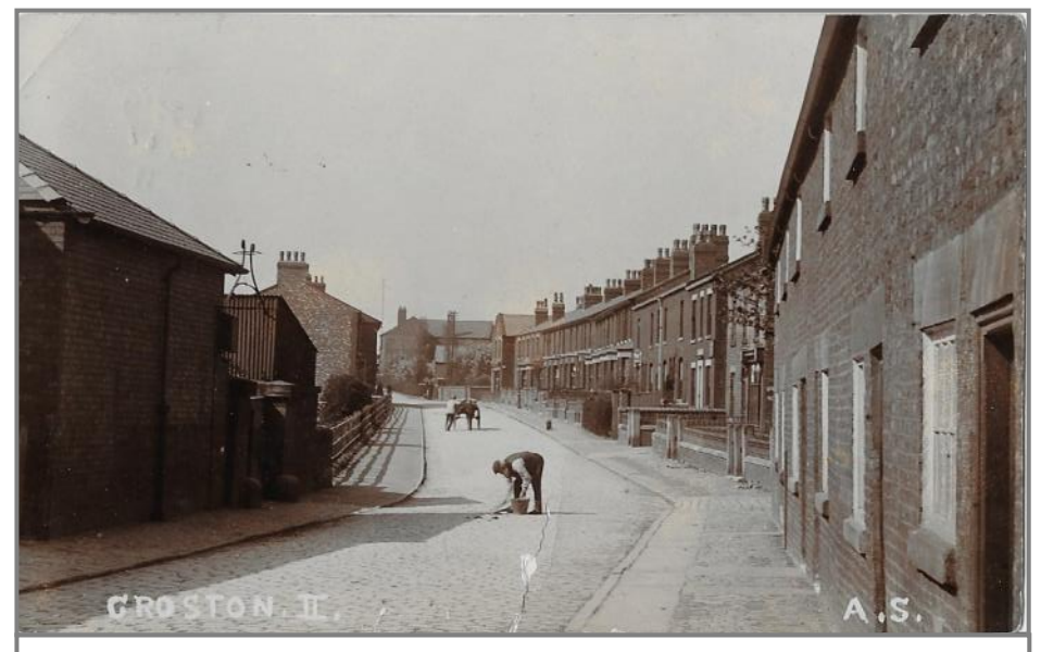
This is a view of Station Road, when cars were unheard of, manure was free, and Croston had it's own gas works (left).

Three postcards were handed over to Croston Archive by the parish clerk, who had been sent them by a thoughtful man in Blackburn. Treasures turn up this way, and we had not seen two of the views. They will be on view when we next hold a display, 8<sup>th</sup> May, at the Old School.